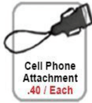
Cell Phone Attachment