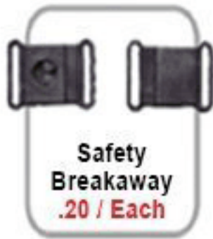
Safety Breakaway .20 / Each