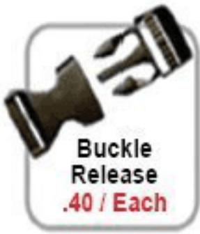
Buckle Release .40 / Each