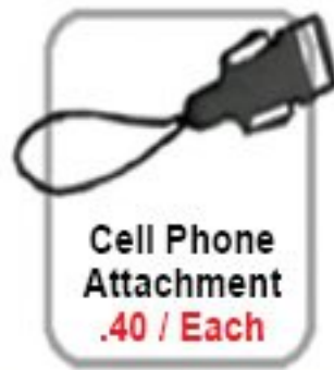
Cell Phone Attachment